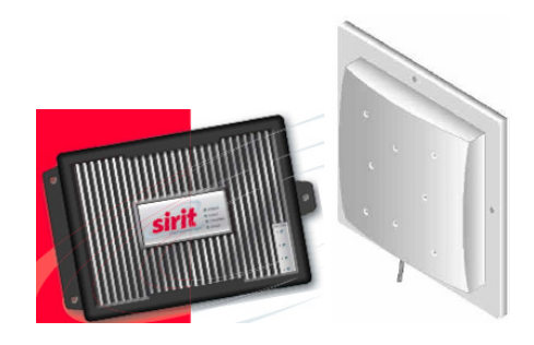
Reader and UHF antenna

The management of the readers takes place using RFID middleware software components, which can be advantageous in eliminating problems of complexity deriving from the RFID infrastructure and from the typically pre-existing back-end software.