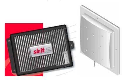
Reader and UHF antenna

The readers supplied by Kyema have an Ethernet port and can therefore operate with just a simple connection to the company's LAN.