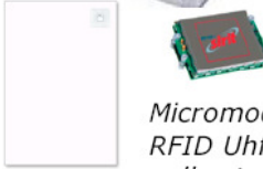
Micromodulo RFID Uhf integrato nella stampante

In order to manage the automation of the office to best effect, as well as the RFID UHF device Kyema suggests using the document reader tray. The tray comprises a micro module RFID UHF reader and an