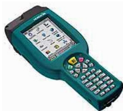
HandHeld RFId UHF

The documents can be searched for within archives using laptop computers fitted with antennas and RFID UHF micro modules. The range of the reading varies from a few cm up to around 2 metres, depending on the power used.