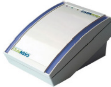
Pos Rfid UHF

RFID_PAPER can be read using any RFID UHF EPC GEN2 compatible reader. Eximia suggests readers in credit card machine format with a USB connection for readings from personal computers (supported by Linux, MacOSX and Windows operating systems). These credit card machine-style devices guarantee a reading from just a few cm (around 2-5 depending on the type of tag) with 25 milliwatts of power, and up to 50-60 cm with 0.5 watts of EIRP.